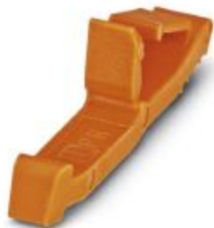
Latching, length: 28.9 mm, width: 3.3 mm, number of positions: 1, color: orange

Please be informed that the data shown in this PDF Document is generated from our Online Catalog. Please find the complete data in the user's documentation. Our General Terms of Use for Downloads are valid ( http://phoenixcontact.com/download )