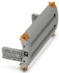
Dummy plug, pitch: 8.2 mm, length: 72.9 mm, width: 196.4 mm, number of positions: 20, color: gray

Please be informed that the data shown in this PDF Document is generated from our Online Catalog. Please find the complete data in the user's documentation. Our General Terms of Use for Downloads are valid ( http://phoenixcontact.com/download )