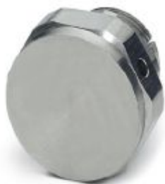
Pressure compensation element, material: Brass, nickel-plated, application: Ex, connecting thread: M20 x 1.5, color: silver

Please be informed that the data shown in this PDF Document is generated from our Online Catalog. Please find the complete data in the user's documentation. Our General Terms of Use for Downloads are valid ( http://phoenixcontact.com/download )