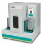
Laser marker incl. extraction unit, includes operating instructions, declaration of conformity, LS adapter plate, type E and F power cables, LAN cable, D-SUB cable 25-pos., suction tube, crevice nozzle set and filter equipment

Laser marker - TOPMARK NEO SET - 1012018