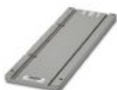
Magazine, for CMS-P1-PLOTTER and PLOTMARK, for accommodating UC-EMP..., UC-EMLP...