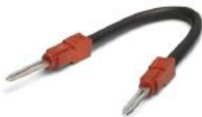
The figure shows the 60 mm version

Wire bridge, length: 250 mm, width: 5.1 mm, number of positions: 1, color: red/black