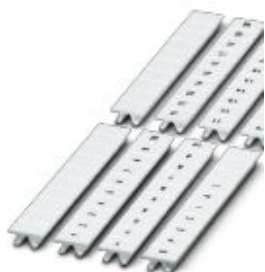
Zack marker strip, 10-section, horizontally labeled with the consecutive odd numbers: 1 ... 19, white, width: 5 mm

Please be informed that the data shown in this PDF Document is generated from our Online Catalog. Please find the complete data in the user's documentation. Our General Terms of Use for Downloads are valid ( http://phoenixcontact.com/download )