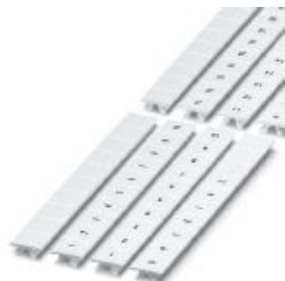
Zack marker strip, 10-section, vertically labeled with the consecutive numbers: 1 ... 10, white, width: 10 mm

Please be informed that the data shown in this PDF Document is generated from our Online Catalog. Please find the complete data in the user's documentation. Our General Terms of Use for Downloads are valid ( http://phoenixcontact.com/download )