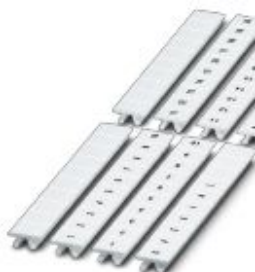
Zack marker strip, 10-section, vertically labeled with the consecutive numbers: 11 ... 20, white, width: 8 mm

Please be informed that the data shown in this PDF Document is generated from our Online Catalog. Please find the complete data in the user's documentation. Our General Terms of Use for Downloads are valid ( http://phoenixcontact.com/download )