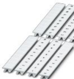
Zack marker strip, 10-section, horizontally labeled with the consecutive numbers: 61 ... 70, white, width: 8 mm

Please be informed that the data shown in this PDF Document is generated from our Online Catalog. Please find the complete data in the user's documentation. Our General Terms of Use for Downloads are valid ( http://phoenixcontact.com/download )