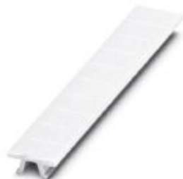
Zack marker strip, 10-section, vertically labeled with the consecutive numbers: 341 ... 350, white, width: 6 mm

Please be informed that the data shown in this PDF Document is generated from our Online Catalog. Please find the complete data in the user's documentation. Our General Terms of Use for Downloads are valid ( http://phoenixcontact.com/download )