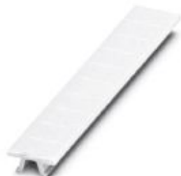
Zack marker strip, 10-section, vertically labeled with the consecutive numbers: 251 ... 260, white, width: 6 mm

Please be informed that the data shown in this PDF Document is generated from our Online Catalog. Please find the complete data in the user's documentation. Our General Terms of Use for Downloads are valid ( http://phoenixcontact.com/download )