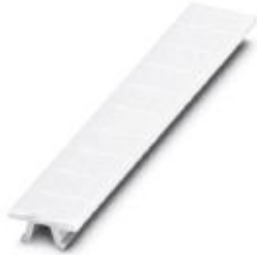
Zack marker strip, 10-section, vertically labeled with the consecutive numbers: 431 ... 440, white, width: 6 mm

Please be informed that the data shown in this PDF Document is generated from our Online Catalog. Please find the complete data in the user's documentation. Our General Terms of Use for Downloads are valid ( http://phoenixcontact.com/download )