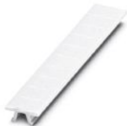
Zack marker strip, 10-section, horizontally labeled with the consecutive numbers: 221 ... 230, white, width: 6 mm

Please be informed that the data shown in this PDF Document is generated from our Online Catalog. Please find the complete data in the user's documentation. Our General Terms of Use for Downloads are valid ( http://phoenixcontact.com/download )