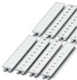
Zack marker strip, 10-section, vertically labeled with the consecutive numbers: 381 ... 390, white, width: 5 mm

Please be informed that the data shown in this PDF Document is generated from our Online Catalog. Please find the complete data in the user's documentation. Our General Terms of Use for Downloads are valid ( http://phoenixcontact.com/download )