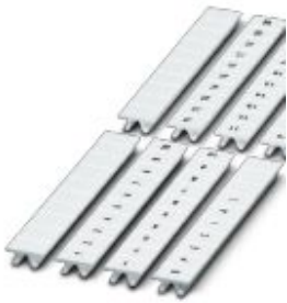
Zack marker strip, 10-section, horizontally labeled with the consecutive numbers: 61 ... 70, white, width: 5 mm

Please be informed that the data shown in this PDF Document is generated from our Online Catalog. Please find the complete data in the user's documentation. Our General Terms of Use for Downloads are valid ( http://phoenixcontact.com/download )