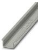
DIN rail, unperforated, Standard profile 2.3 mm, width: 35 mm, height: 15 mm, acc. to EN 60715, material: Steel, galvanized, passivated with a thick layer, length: 2000 mm, color: silver

DIN rail, unperforated - NS 35/15-2,3 UNPERF 2000MM - 1201798