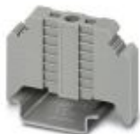
End clamp, width: 9.5 mm, color: gray