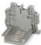
Quick mounting end clamp for NS 35/7,5 DIN rail or NS 35/15 DIN rail, with marking option, with parking option for FBS...5, FBS...6, KSS 5, KSS 6, width: 5.15 mm, color: gray