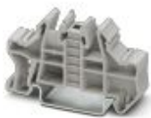
Quick mounting end clamp for NS 35/7,5 DIN rail or NS 35/15 DIN rail, with marking option, width: 9.5 mm, color: gray