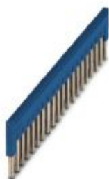
Plug-in bridge, pitch: 4.2 mm, number of positions: 20, color: blue

Please be informed that the data shown in this PDF Document is generated from our Online Catalog. Please find the complete data in the user's documentation. Our General Terms of Use for Downloads are valid ( http://phoenixcontact.com/download )