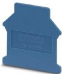
End cover, length: 42.5 mm, width: 1.5 mm, height: 54 mm, color: blue

Please be informed that the data shown in this PDF Document is generated from our Online Catalog. Please find the complete data in the user's documentation. Our General Terms of Use for Downloads are valid ( http://phoenixcontact.com/download )