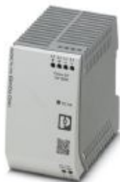
Primary-switched UNO POWER power supply for DIN rail mounting, input: 1-phase, output: 24 V DC/100 W

Please be informed that the data shown in this PDF Document is generated from our Online Catalog. Please find the complete data in the user's documentation. Our General Terms of Use for Downloads are valid ( http://phoenixcontact.com/download )