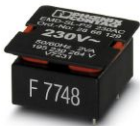
Power modules, pluggable, for EMD-SL-..., supply voltage: 195...264 V AC

Please be informed that the data shown in this PDF Document is generated from our Online Catalog. Please find the complete data in the user's documentation. Our General Terms of Use for Downloads are valid ( http://phoenixcontact.com/download )