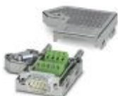
D-SUB connector, 9-pos., male connector, one cable entry < 35°, universal type for all systems, pin assignment: 1, 2, 3, 4, 5, 6, 7, 8, 9 to screw connection terminal block

D-SUB bus connector - SUBCON 9/M-SH - 2761509