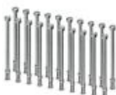
Optional mounting screw, without knurl for narrow installation conditions, slotted head, length: 40 mm, UNC 4-40 thread Supplied as standard: 1 bag of 20 screws