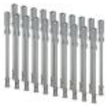
Optional mounting screw, with knurl for mounting by hand or using a screwdriver, bladed, length: 56 mm, metric M3 thread

Screw - SUBCON-RAENDEL-SCREW-3MM - 2310387