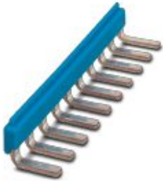
Insertion bridge, pitch: 6.15 mm, number of positions: 10, color: blue

Please be informed that the data shown in this PDF Document is generated from our Online Catalog. Please find the complete data in the user's documentation. Our General Terms of Use for Downloads are valid ( http://phoenixcontact.com/download )