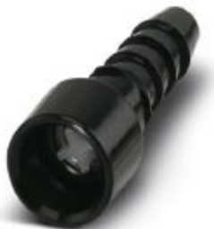
Pneumatic socket with valve, for HC-M-PN3 module, internal hose diameter of 4.0 mm

Please be informed that the data shown in this PDF Document is generated from our Online Catalog. Please find the complete data in the user's documentation. Our General Terms of Use for Downloads are valid ( http://phoenixcontact.com/download )