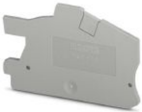
End cover, length: 66 mm, width: 2.2 mm, height: 42.3 mm, color: gray

Please be informed that the data shown in this PDF Document is generated from our Online Catalog. Please find the complete data in the user's documentation. Our General Terms of Use for Downloads are valid ( http://phoenixcontact.com/download )