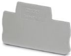
End cover, length: 67.6 mm, width: 2.2 mm, height: 39.7 mm, color: gray

Please be informed that the data shown in this PDF Document is generated from our Online Catalog. Please find the complete data in the user's documentation. Our General Terms of Use for Downloads are valid ( http://phoenixcontact.com/download )