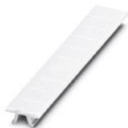
Zack marker strip, 10-section, horizontally labeled with the consecutive numbers: 1 ... 10, white, width: 6 mm

Please be informed that the data shown in this PDF Document is generated from our Online Catalog. Please find the complete data in the user's documentation. Our General Terms of Use for Downloads are valid ( http://phoenixcontact.com/download )